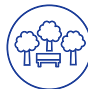
Public Parks, Parking Lots, & More