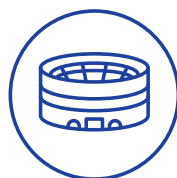
Stadiums and Amusement Parks